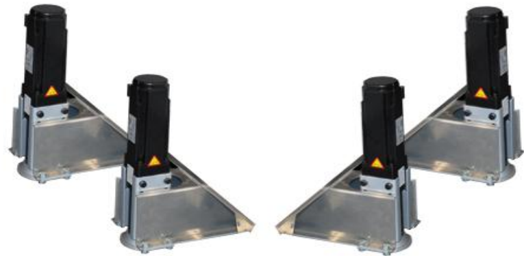
ProMotion Cueing System Four Precision Electric Motion Actuators