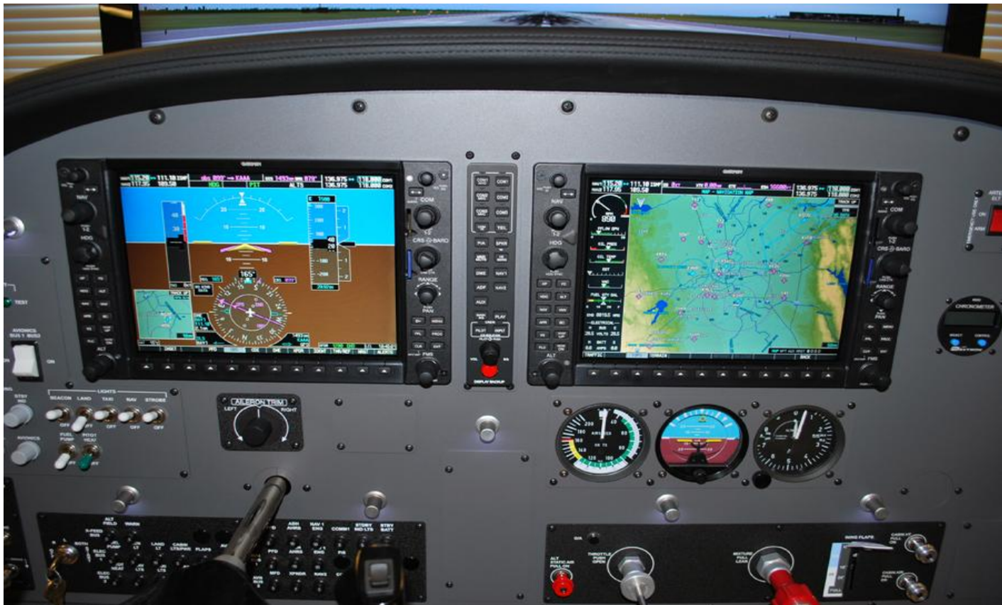
Real Garmin G1000 PFD and MFD