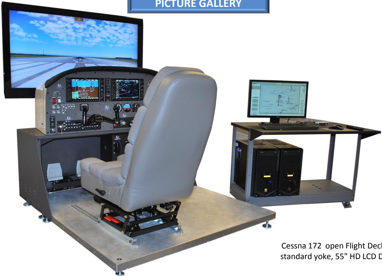
Cessna 172 open Flight Deck configuration shown with standard yoke, 55" HD LCD Display and Instructor's Desk